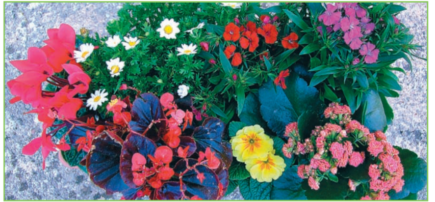
Beautiful window box

top up our mini worm composter and as a result lost a lot of the worm population.