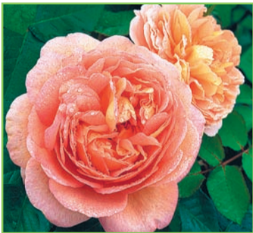
Abraham Darby variety

The answer is they can do. In theory they can be grown everywhere but they will do best