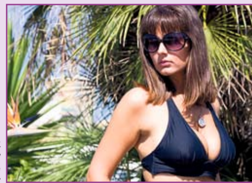
A sneak preview of the calendar

THIS WEEK, RTN, was proud to get a sneak preview of The Bikini Bash Charity Calendar for 2011.