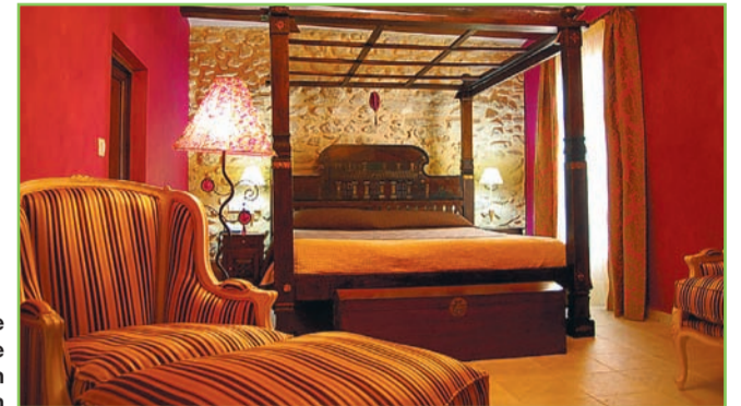
The Flore de Pasion bedroom

I'm shown to the Al-Azraq room, the name taken from the infamous Moorish leader who hailed from the nearby Val de Alcalá, and who died under the walls of Xàtiva Castle. I'm spellbound by the rich purple/brown texture of the walls that set off the silver carved sofas with their deep