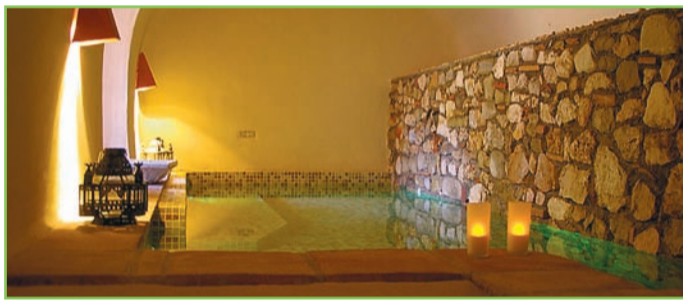
The indoor pool

For further information: www.elcaprichodelaportuguesa.com , Tel. 966 406 674 / 639 690 638